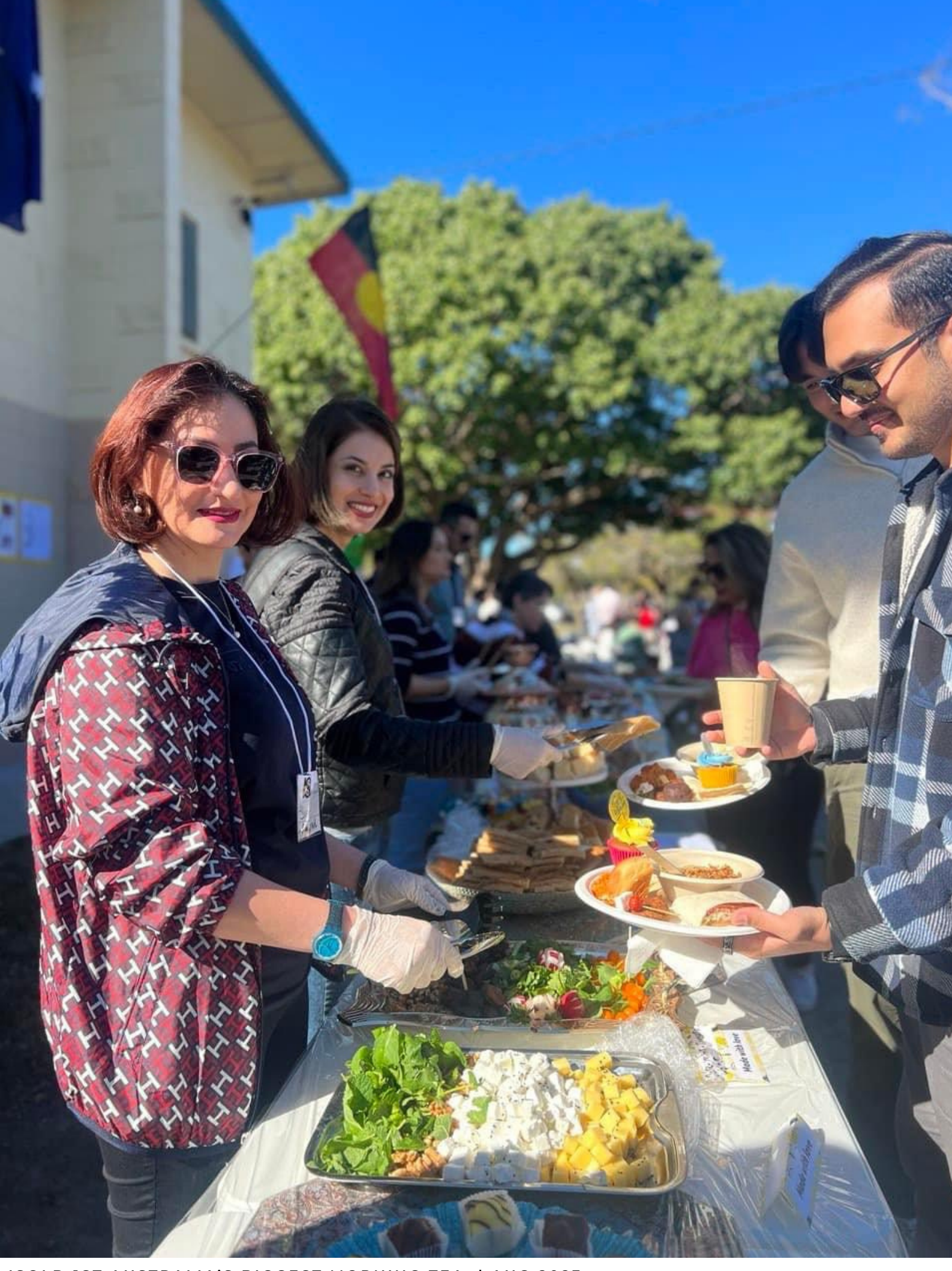
ISQLD 1ST AUSTRALIA'S BIGGEST MORNING TEA | AUG 2023